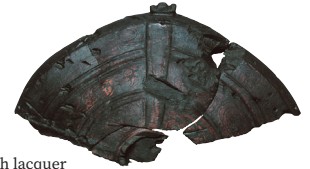
The remains of Itoku; Wooden-body coated with lacquer

This year, archeology center will introduce various ancient colors that were excavated in Shikoku. Please feel a thought for the color of ancient people.