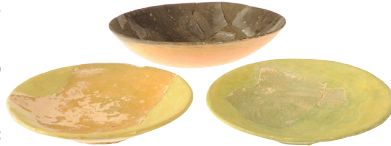
The remains of Kazashi; Green-glazed ware and Black earthenware

Archeology center will display earthenware that was excavated in Kochi from the Asuka period to the Heian period.