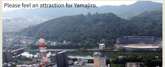
The remains of Ushioe-jo