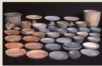
The remains of Shimonotsubo; Sue pottery Haji pottery

Hour: 13:30–15:00 Capacity: About 40 people Participation fee: Free The prior entry is unnecessary